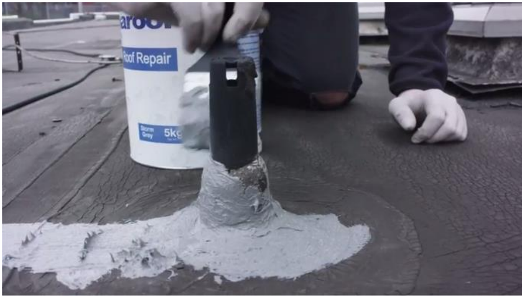
Fig 7 - Applying the product around a pipe extrusion.

Apply the product around any extrusions in the damaged area to ensure a completely watertight seal.