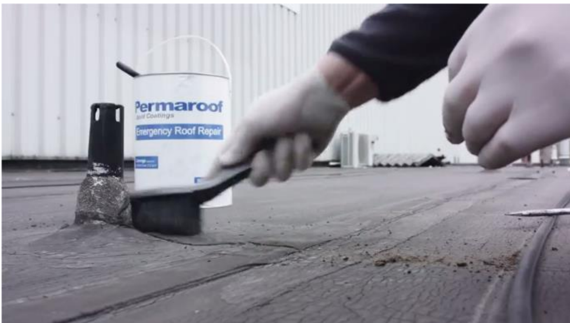
Fig 3 - Brushing away loose debris to complete preparation of the area.

Once the surface is completely clear of debris and dust, you are now ready to apply the Permaroof Emergency Roof Repair.