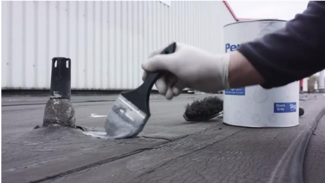
Figs 5 & 6 - Working the Emergency Roof Repair into the damaged area of the flat roof.

Using a suitable brush, generously apply the Emergency Roof Repair product to the affected area. Use the brush to work the product deep into any cracks, taking care not to create air pockets.