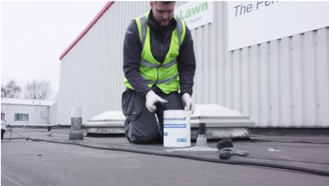
Fig 9 - Replacing the lid tightly.

Replace the lid on the tin of Emergency Roof Repair product and secure down tightly.