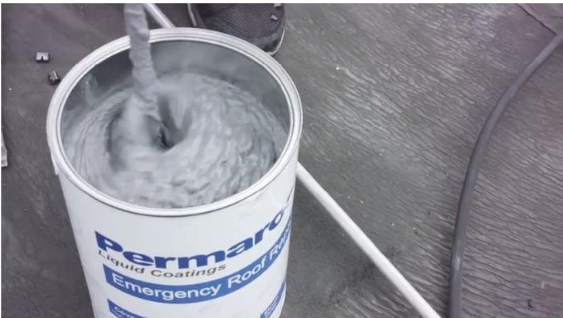
Fig 1 - Thoroughly mixing the Permaroof Emergency Roof Repair product.

Remove the lid from the Permaroof Emergency Roof Repair product and mix thoroughly for several minutes, or until the product is fully blended.